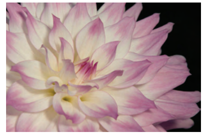
April Dawn B ID LtBld Wh/Pk 2008 Dahlia of the Year