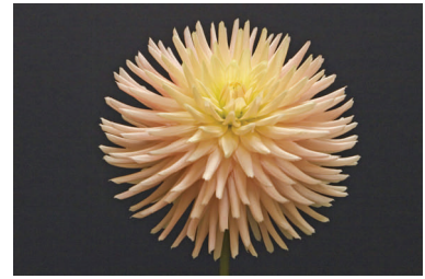
Embrace BB SC Yellow 2009 Dahlia of the Year